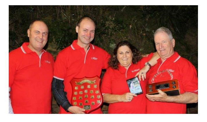
Australia Post sponsored Division 3 Spring Series winners....Xena Warrior Princess.