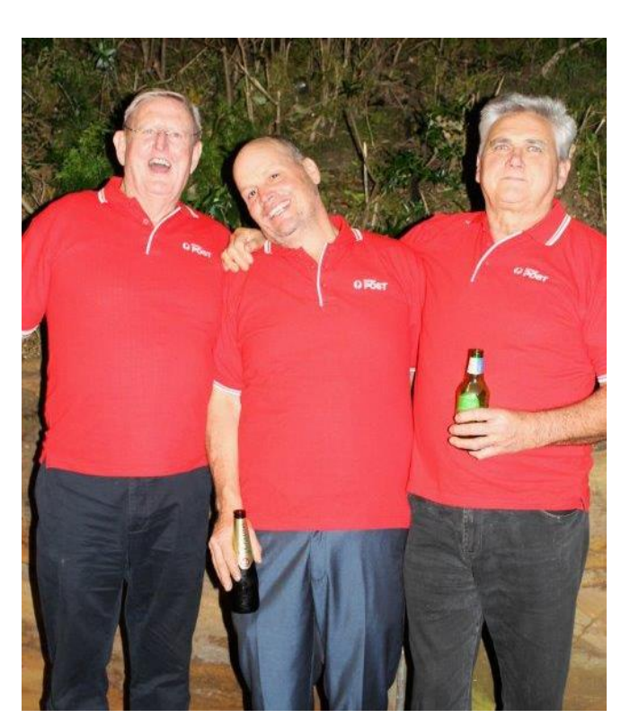
Australia Post Division 1 Spring Series winners.....the three tenors......aka Axis of Evil.

PRSC welcomes new skippers and crew - see <a href="https://www.prsc.org.au">www.prsc.org.au</a> for details - or attend the club at the end of Wharf Road Gladesville any Saturday afternoon scheduled races are on. July 2017.