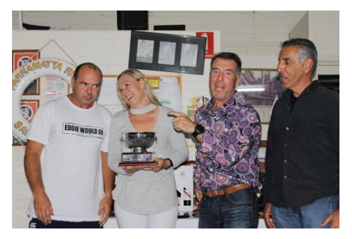
Most improved – Memphis.