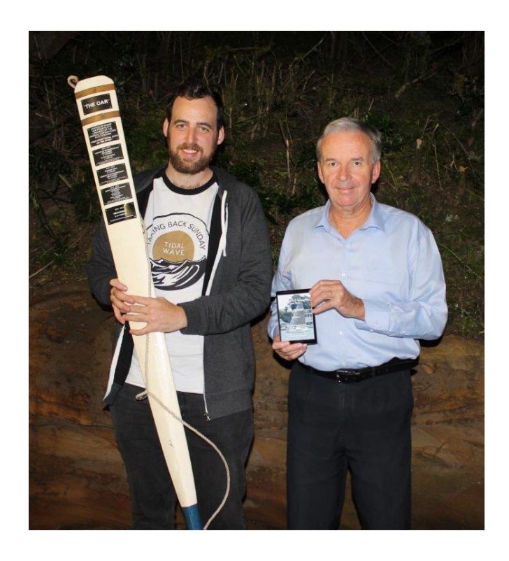
The Oar Trophy for spectacular acts to Resurgent for having the 11/2 race in the bag for both scratch and hcap, and then ran straight over the top of the Abbotsford club flag buoy, got it fully tangled around the fin keel and bulb......who was steering ???